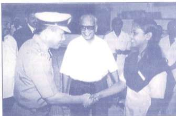
The Chief Guest, The Commissioner of Police, Madurai, Shaking hands with the Head Girl