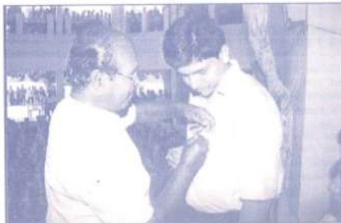
Head boy's badge being pinned by the Assembly Speaker