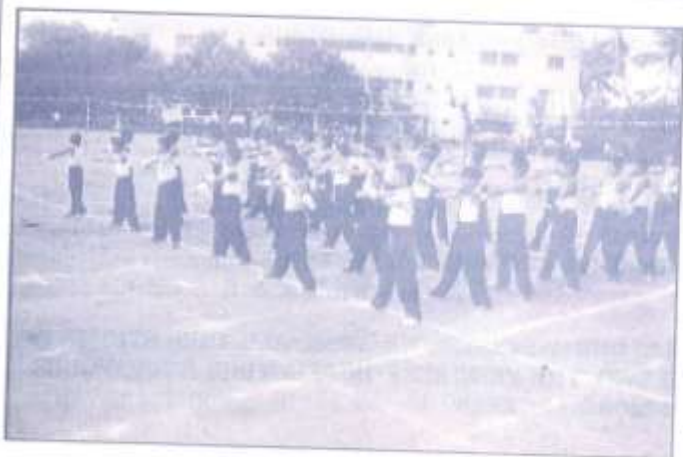
Boys doing Drill