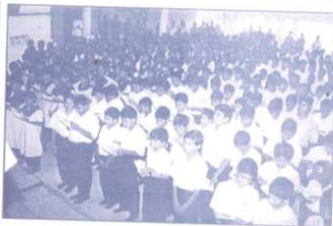
Singing in the Assembly