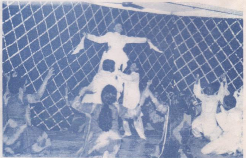
A DANCE IN PROGRESS