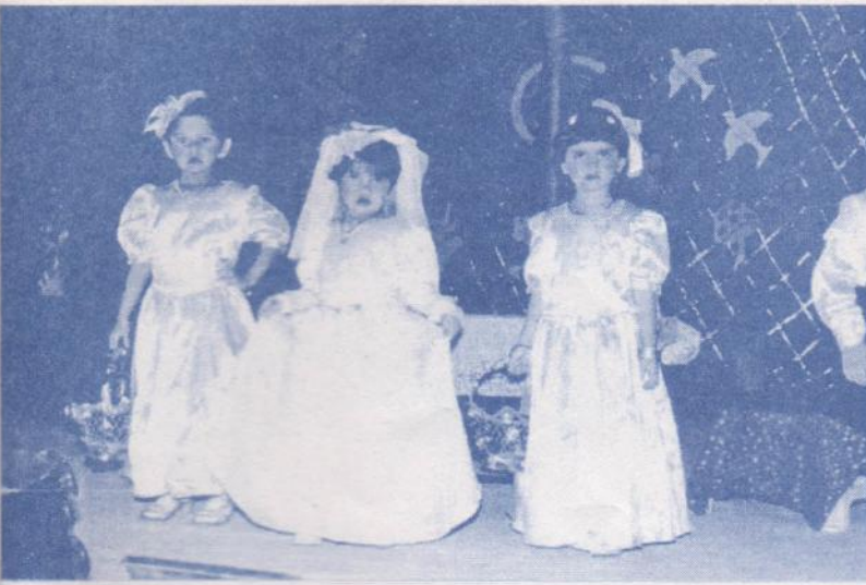
DANCING BY TINY - TOTS