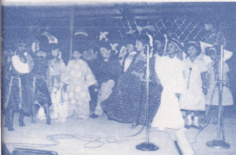
WE ARE THE WORLD !