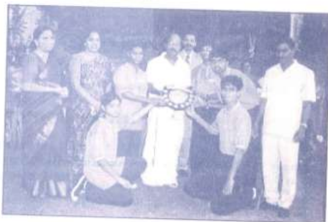
Winners with the Chief Guest, The Speaker of the T.N. Assembly