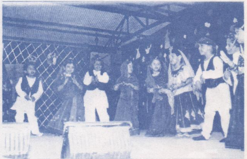
GROUP DANCE BY JUNIORS