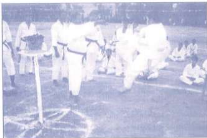
Karate- a boy in action