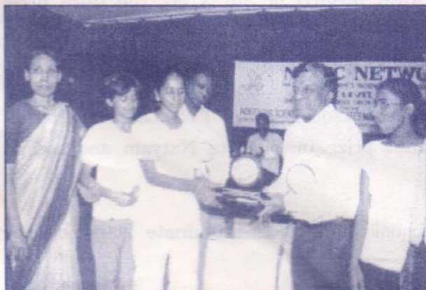
Our Children and the Guide Teacher at the Science Project Centre at Karikudi.

If Parents other than those on the Committee are interested in this presentation, we can plan a second presentation at about 6-30 p.m. and the presentation will be for 45 minutes. Those interested may inform the school office.