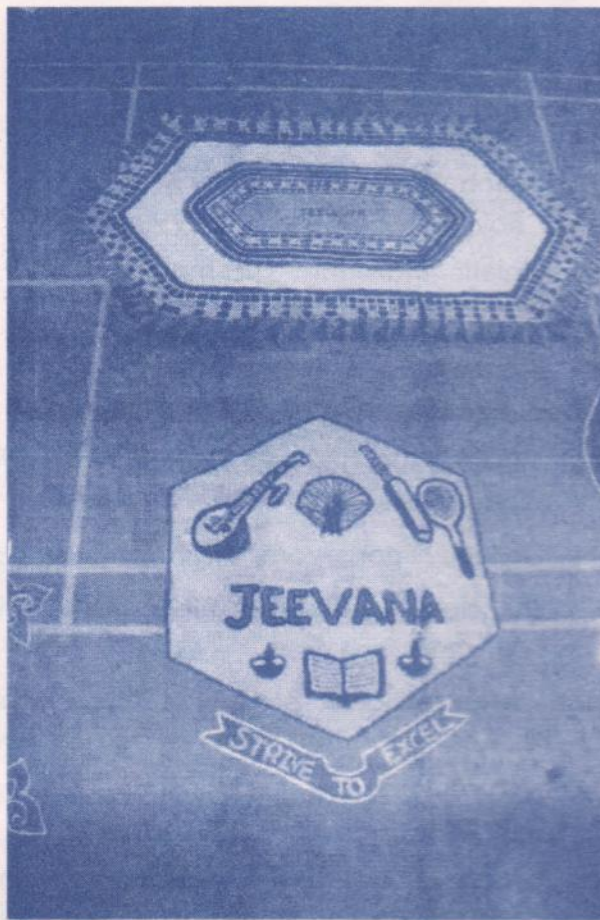
CARPET KOLAM AND SALT KOLAM